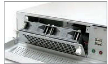
Front Replaceable Air Filters/Fans Convenient to change air filters or fans when needed