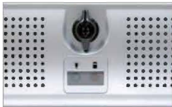
Thumb Lock Convenient to operate or protect the system