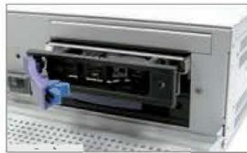
Two Swappable SATA HDD Drives Easy to access HDD drives