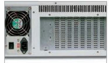
Excellent Cooling System New slot cover for better ventilation