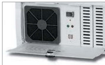
Plastic Fan Filter For easy cleaning and replacing