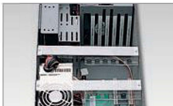
Two Adjustable Card Retainer Positions For fixing all the cards more flexibly and tightly