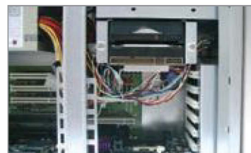
New HDD Drive Design Easy to install HDD drives