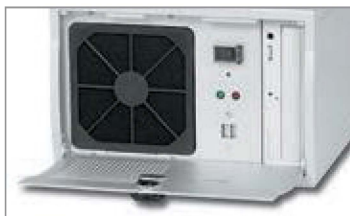
Plastic Fan Filter For easy cleaning and replace